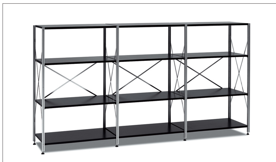
System shelf, 207 x 108 cm

Depending on the required depth and width, the system shelving can be fitted with shelves, pull-out shelves, clothes rails, drawers, wire baskets and clothes lifts and supplemented with a folding curtain.