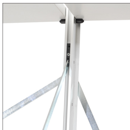
Shelf lying on shelf support