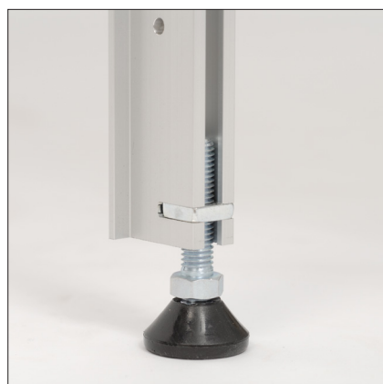
Adjustable foot to compensate for uneven floors